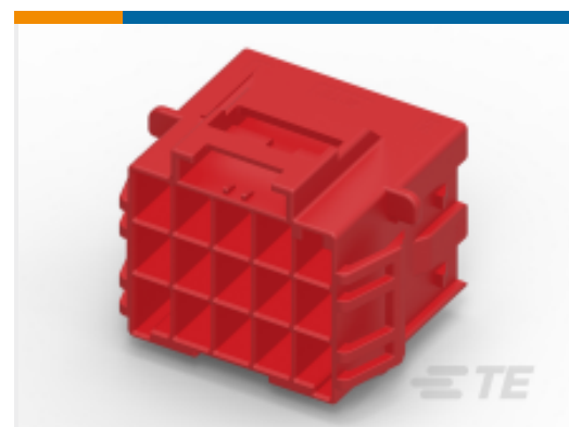
TE Part # CAT-P87074-C1701A POWER TRIPLE LOCK HIGH TEMP CAP