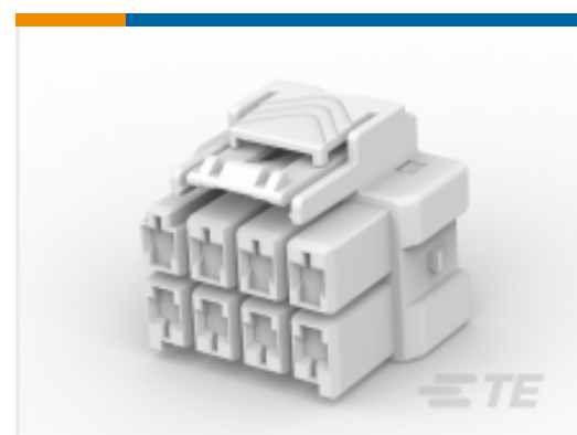
TE Part # CAT-P87074-P729 POWER TRIPLE LOCK Plug, Standard Temperature