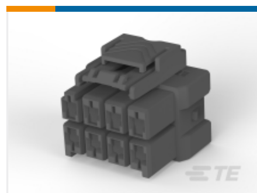
TE Part # CAT-P87074-P729B POWER TRIPLE LOCK GLOW WIRE PLUG