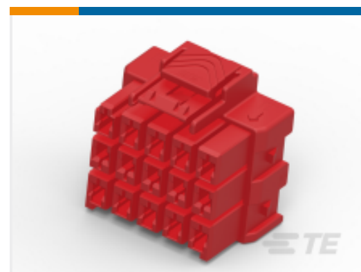
TE Part # CAT-P87074-P729A POWER TRIPLE LOCK HIGH TEMP PLUG