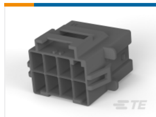
TE Part # CAT-P87074-C1701B POWER TRIPLE LOCK: Glow Wire Cap