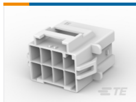
TE Part # CAT-P87074-C1701 Standard Temperature Caps | POWER TRIPLE LOCK